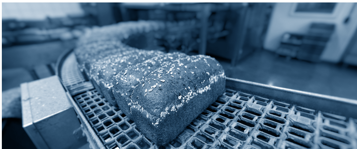
Table V: Theoretical calculations for iron contents in final products prepared with iron-biofortified grains